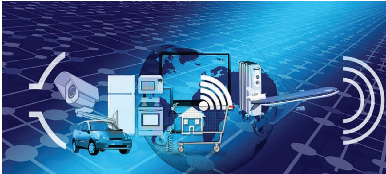
Figure 1.2: ICT Around Us

digital television. In addition to printed newspapers now we also have their electronic versions. Along with traditional radio, we also have online radio.