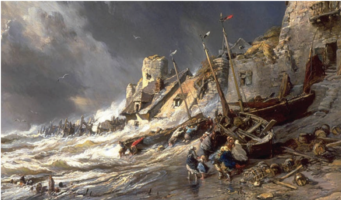
Figure 1.1: Coast Scene

Technology refers to methods, systems and devices, which are a result of scientific knowledge, being used for practical purposes. For example, Muskan went to an excursion to Bhubaneswar and visited the State Museum. She saw various mineral ores in the mineral section of the museum. She decided to capture photographs to share with others who may not have seen the ores. She borrowed her teacher's mobile and clicked pictures of the rare collection. She shared all the pictures on her blog along with a description of the ores. Many viewers commented and appreciated Muskan for sharing those pictures and description.