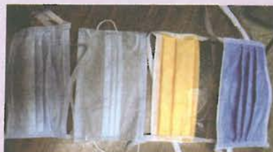
Fig. 1.4: A collection of surgical masks

Solving real problems requires knowledge from several branches of science. During the COVID-19 pandemic, we all used masks for safety (Fig. 1.4). Understanding how a mask works requires concepts from physics (particle motion and electrostatic attraction), chemistry (properties of polymer fibres), biology (size and behaviour of viruses), and mathematics (modelling airflow and filtration efficiency).