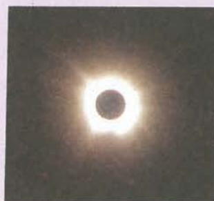
Fig. 1.2: A total solar eclipse

A commonly circulated claim is that, "Food should not be eaten during an eclipse because it becomes harmful". Disproof comes from asking simple scientific questions. An eclipse is just a play of shadows (Fig. 1.2). What physical change occurs during an eclipse? Does temperature change significantly? Does food go bad if it is left in a shadow? You will conclude that no physical, chemical, or biological mechanism supports such a claim.