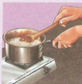
Fig. 1.3: Rice being cooked on a gas stove

To make a rough estimate, assume that all their calorie needs come from rice alone (Fig. 1.3). An average adult needs about 2000 – 2500 kilocalories (kcal) per day. Find out how many calories 100 g of uncooked rice provides when cooked and use this to estimate the daily requirement for the family. The aim is not to get an exact number, but to check whether the answer makes sense as 100 g for a month is clearly too little, while a few tonnes is far too much. Such estimation helps connect science to everyday questions about food and resources, and shows why approximate reasoning is an important scientific skill.