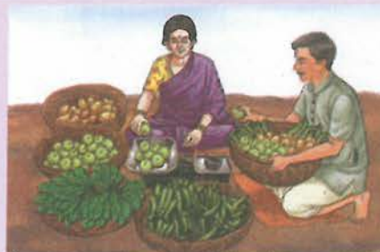
Fig. 1.1: A vegetable seller using a pan balance

When we buy rice or vegetables we expect a kilogram to mean the same amount everywhere (Fig. 1.1). Imagine the confusion if we used different weights everywhere! Thankfully, measurements are based on agreed international standards, not local objects or opinions. Standard units allow scientific results to be compared, and ensure fairness in daily life and trade.