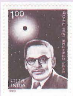
Meghnad Saha on an Indian postage stamp