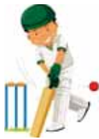
Mahesh / play

Look at the pictures. Write sentences as given in the example: