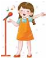
Sonal / sing